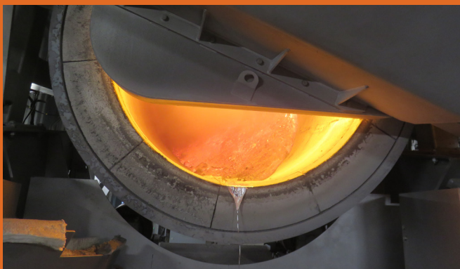
Above, we can design, manufacture and install super duty Armourcast pre-cast blocks.