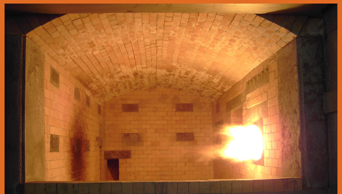
Above, just a couple of examples of work our refractory services team has completed.